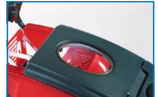
The operator can always see inside the tank