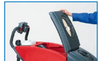
Easy to open and to clean