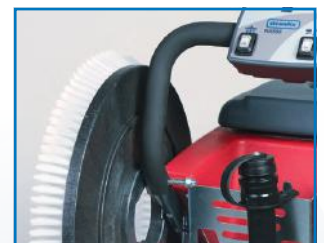
Brush holder for storage