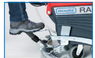
Suction unit and brush head lifting by foot